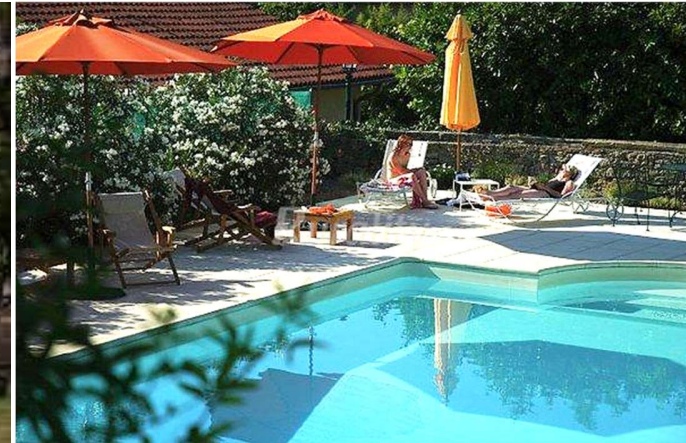
example boutique hotel in fleurance, lectoure, condom, saint puy